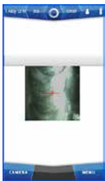
1. Position the X-MET using the camera image