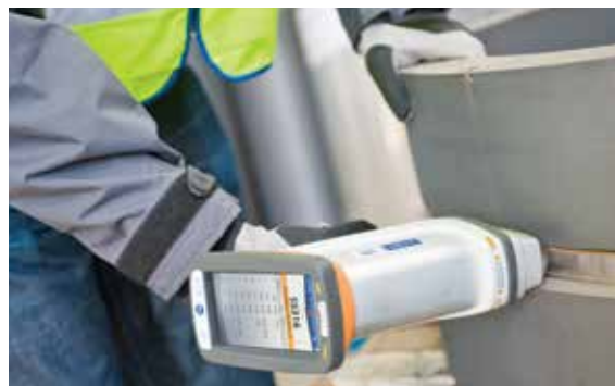
2. Press the trigger to start the analysis